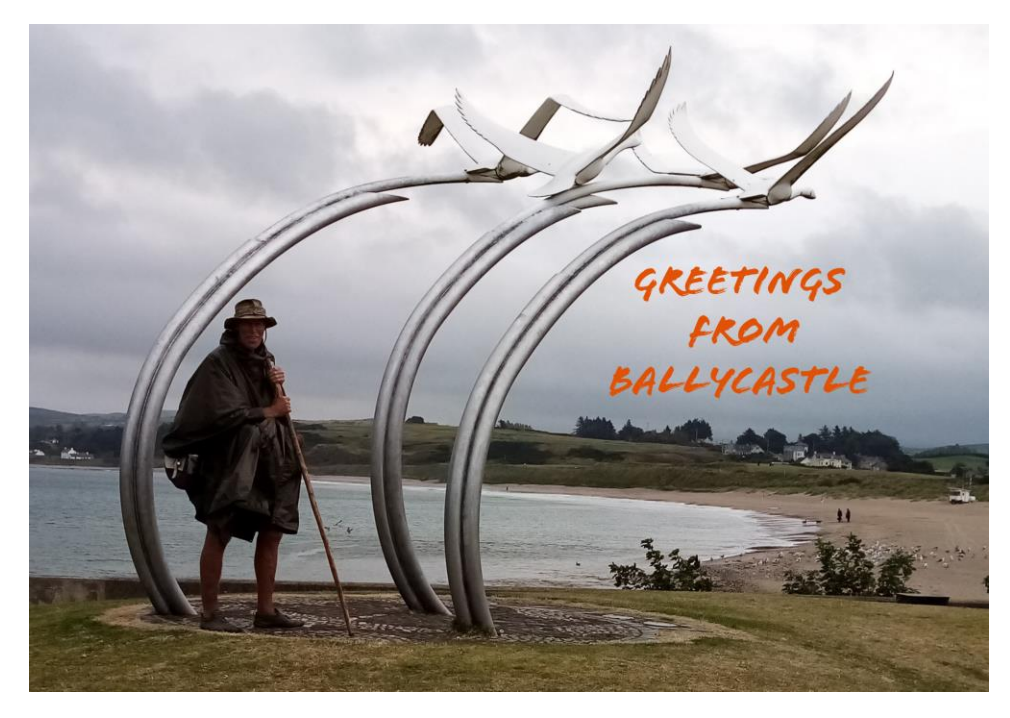
With an illustration of another part of his journey: