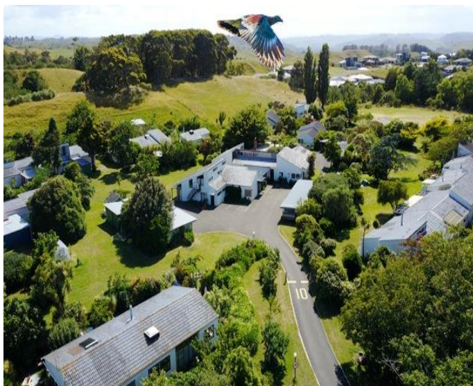
The Settlement from above