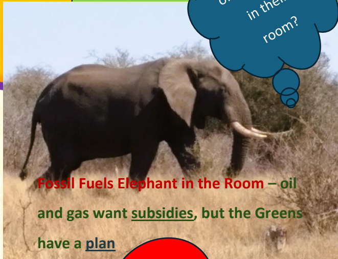
Fossil Fuels Elephant in the Room – oil and gas want subsidies , but the Greens have a plan