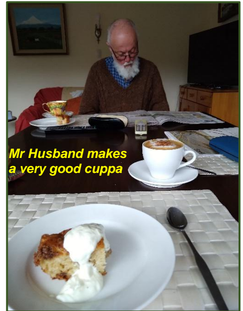
Mr Husband makes a very good cuppa